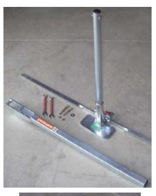
Step I: Place contents of box on floor or table. Place handle over riser tube with decal facing up and insert short 3/8" - 24 bolt.